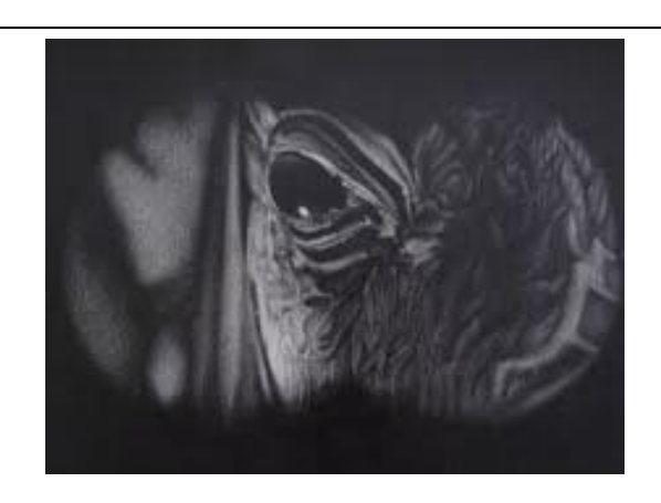
Moonless Night, pencil on paper 2013

phone 028 22090 or email alison@westcorkartscentre.com